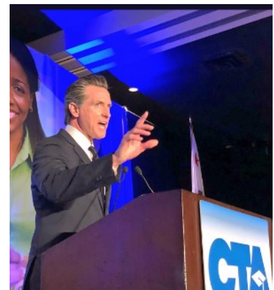
CA Lt. Gov. Gavin Newsom addresses CTA State Council