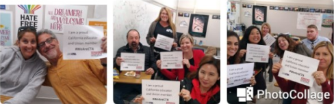
Proud CA Educators and Union Members at PVHS. #WeAreCTA

rise in such groups advertising that they can replace the work your union does for a fraction of the cost. This is UNTRUE. They have been reaching out to districts to gather member contact information to persuade members to drop their union membership. Please know that your local is the exclusive representative for you and NO entity can replace the work your union does on your behalf. If you are contacted by these entities, please advise your site rep ASAP.