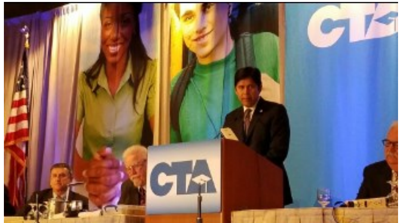
CA Senate President pro Tempore, Kevin DeLeon

CTA State Council Representative, District ILA6