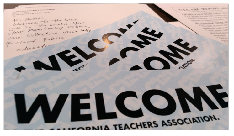
Writing welcome postcards to new CTA members.

Member engagement will be a recurring theme this year. Our local site reps are our best ambassadors for engaging members and helping them understand the value of membership. Do you know your site rep? If you do, please reach out to them if only to say hello. If you do not know your site rep, inquire with colleagues to find out who represents you at your site.